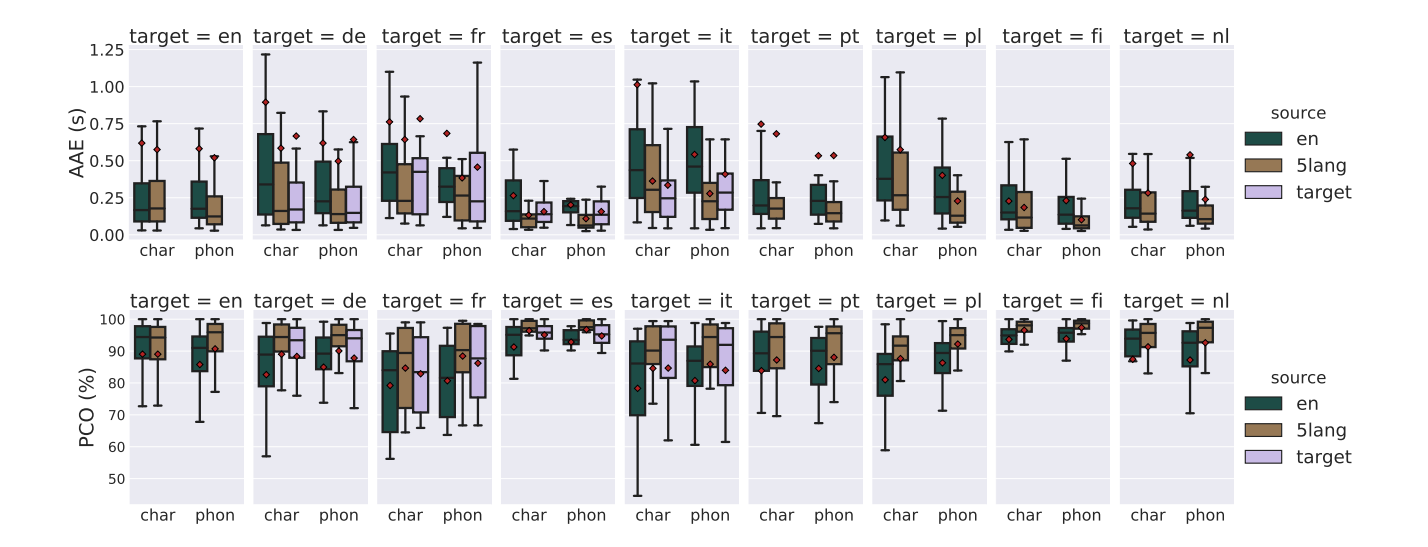
Figure 2. Lyrics-to-audio evaluation on DALI language subset datasets for phoneme and character based architectures. Several training set design strategies are considered. Languages are given by their ISO 639.1 code. Here "source" refers to data language used to train the given model and "target" refers to data language used to evaluate the trained model. When source is equal to target, architectures are trained and tested on the same language. Mean AAE is better if smaller, mean PCO is better if larger. Mean values are displayed using squares