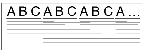
Figure 2. Closed patterns found in a cyclic sequence of symbols. The occurrences of the pattern shown in thick lines do not overlap, whereas those shown in thin lines do.