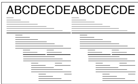
Figure 1. Patterns found in a sequence of symbols. Below the sequence, each row represents a different pattern class with the occurrences aligned to the sequence. Thick black lines correspond to closed patterns (the upper one is the maximal pattern), grey lines to prefixes of closed patterns, and thin lines to non-closed patterns.