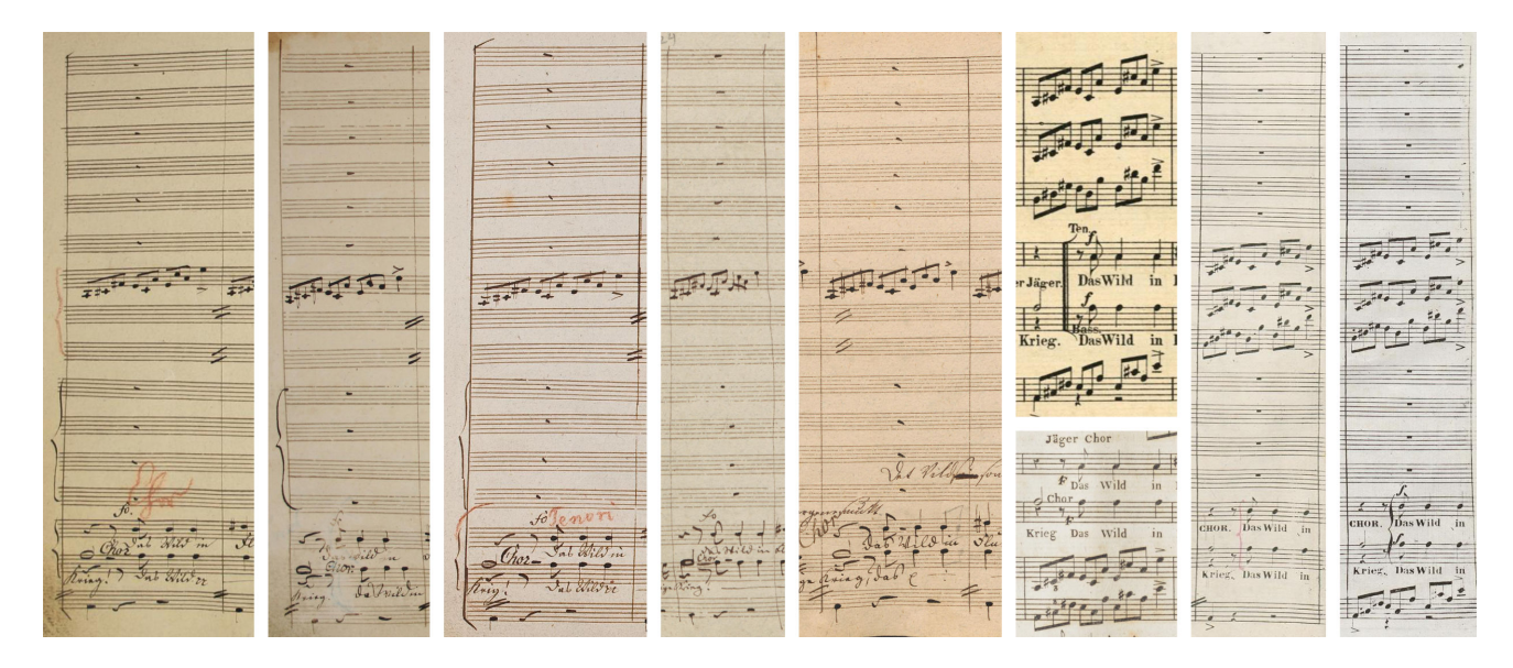
Figure 1 . Examples of cropped measures originating from different sources of the same work. All measures represent the same musical position, i.e. the same measure, within the work, but are in part extremely diverse in terms of instrumentation, graphic representation and also image resolution.