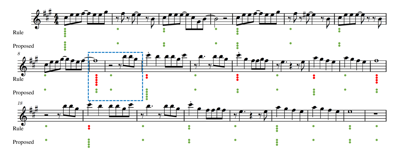
Figure 4. A case study with song RWC-POP No. 008 from the test split. The song is multi-track but we only show the main melody here. The metrical structure of the song does not satisfy binary regularity because of the 2-bar extensions in the pre-chorus (marked by a dashed blue box), causing hypermeter changes. The prediction of the proposed method aligns well with the reference. The errors in the rule-based prediction are marked in red (better viewed in color).