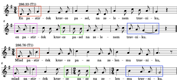
Figure 2. Two variants (out of 34) of the subtype 286.T1 with similar melodies with short melodic patterns in coloured squares.

We assume that the contrasting beginnings and endings of each verse offer pitch orientation for the singers, given the repetitive structure of narrative songs. The contour relationship between the first, middle, and last phrases supports the notion that “what goes up is likely to come down,” as proposed by Huron [13].